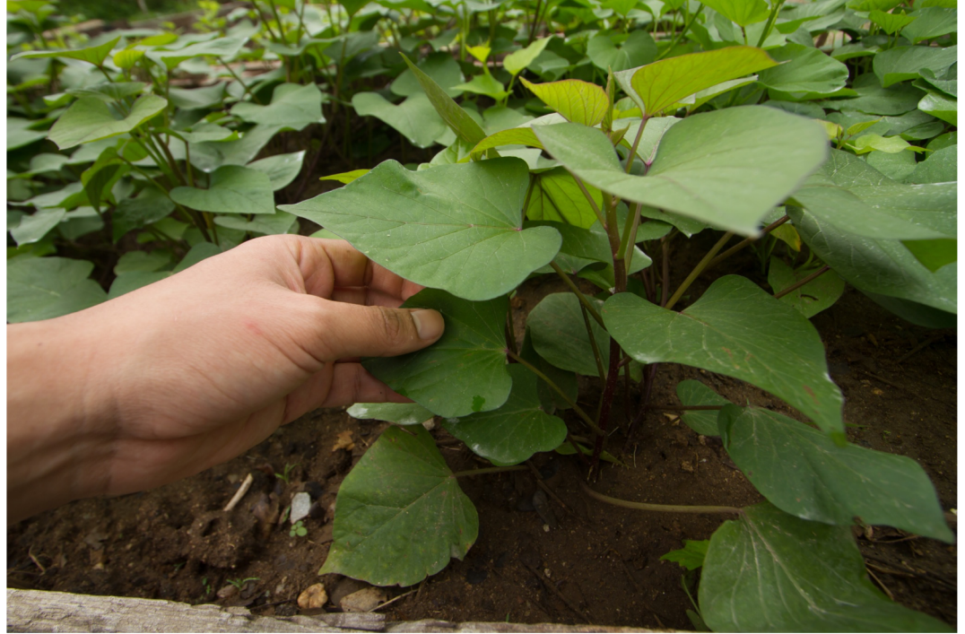
Sweet Potato Vine